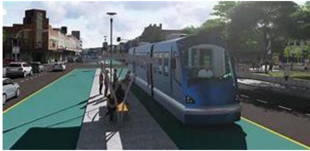
Examples of rapid transit solutions and the desired level of segregation